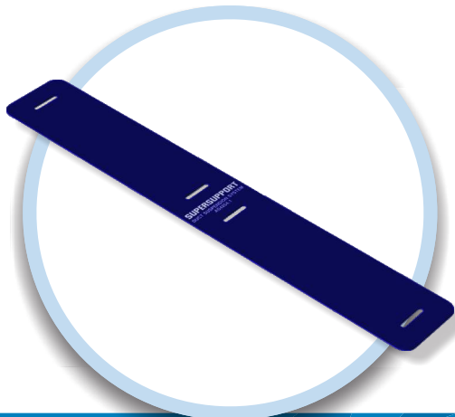
DSSS - Strap