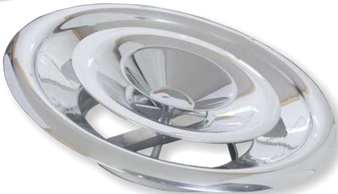
ADSCD - SPUN CIRCULAR DIFFUSER