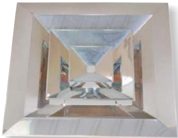
ADCD - CEILING DIFFUSER