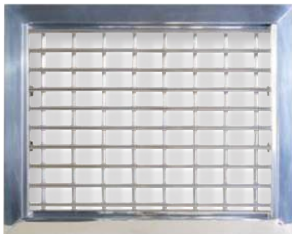
ADDD - DOUBLE DEFLECTION GRILLE